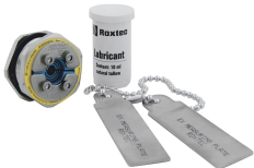
C RS T Ex seal

For detailed information, please visit roxtec.com .